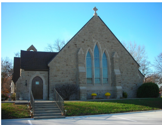
Sacred Heart Church

514 Parker Ave, Osawatomie, KS 66064 https://www.miamilinnccatholics.org/SPN