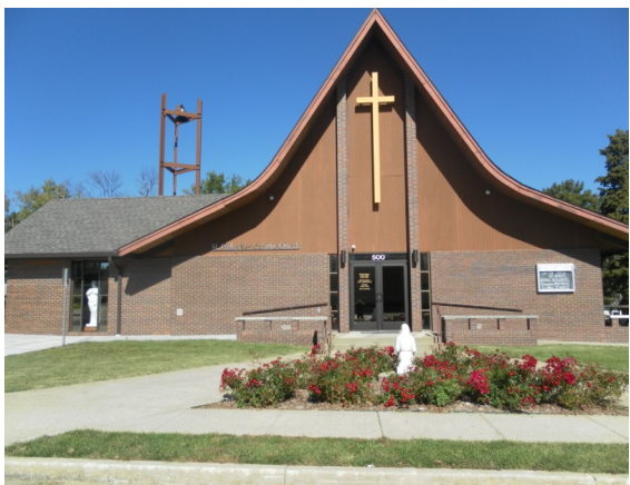
St. Philip Neri Church

514 Parker Ave, Osawatomie, KS 66064 https://www.miamilinnccatholics.org/SPN