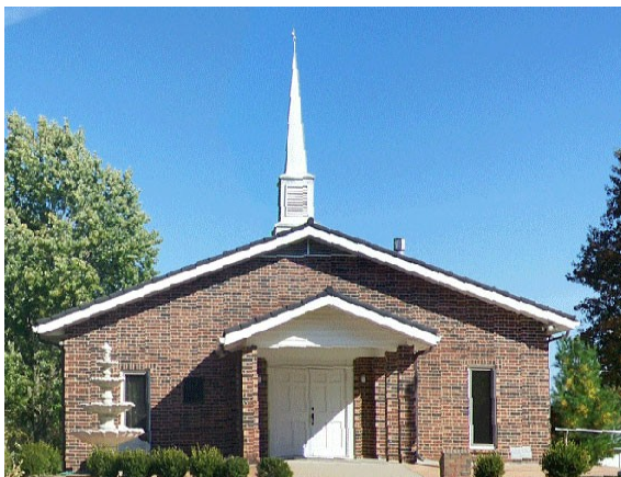
Our Lady of Lourdes Church

729 W Main St, Mound City, KS 66056 https://www.miamilinnccatholics.org/SH