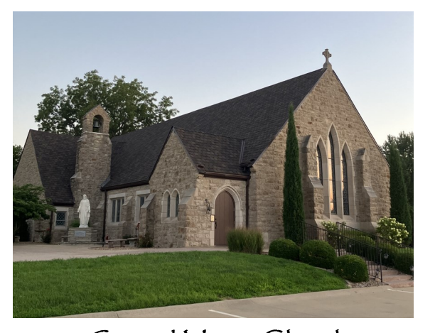
Sacred Heart Church (St. Rose Philippine Duchesne Shrine) 729 W Main St, Mound City, KS 66056 https://www.miamilinncatholics.org/SH