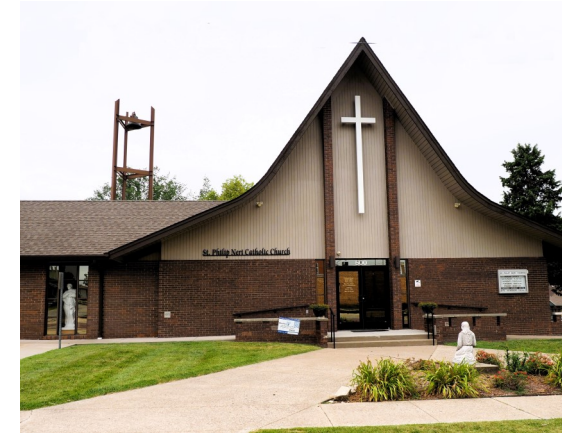
St. Philip Neri Church 514 Parker Ave, Osawatomie, KS 66064 https://www.miamilinn Catholics.org/SPN

15th Sunday in Ordinary Time July 14th, 2024