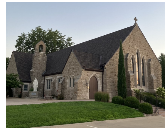
Sacred Heart Church (St. Rose Philippine Duchesne Shrine) 729 W Main St, Mound City, KS 66056 https://www.miamilinn Catholics.org/SH