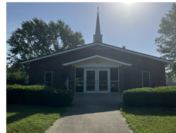
Our Lady of Lourdes Church 819 N 5th St, LaCygne, KS 66040 https://www.miamilinn Catholics.org/OLL