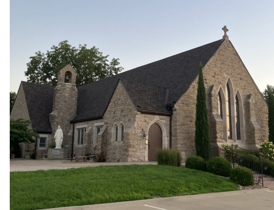
Sacred Heart Church (St. Rose Philippine Duchesne Shrine) 729 W Main St, Mound City, KS 66056 https://www.miamilinn Catholics.org/SH