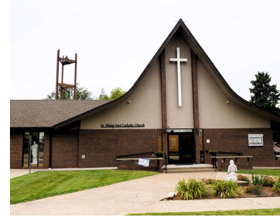
St. Philip Neri Church 514 Parker Ave, Osawatomie, KS 66064 https://www.miamilinn Catholics.org/SPN